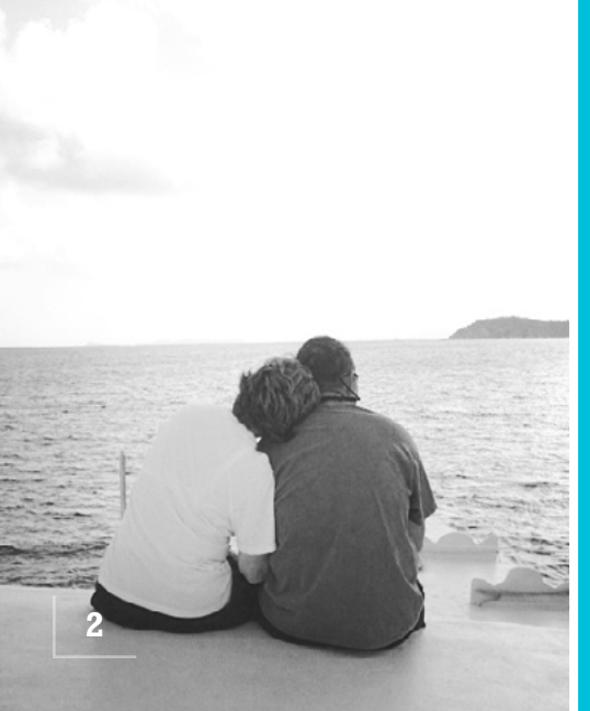
Photo submitted by Pam from Texas , valued annuity customer since 2003.