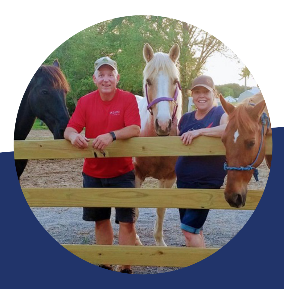
Photo submitted by Harriet from Missouri , valued annuity customer since 2016 .