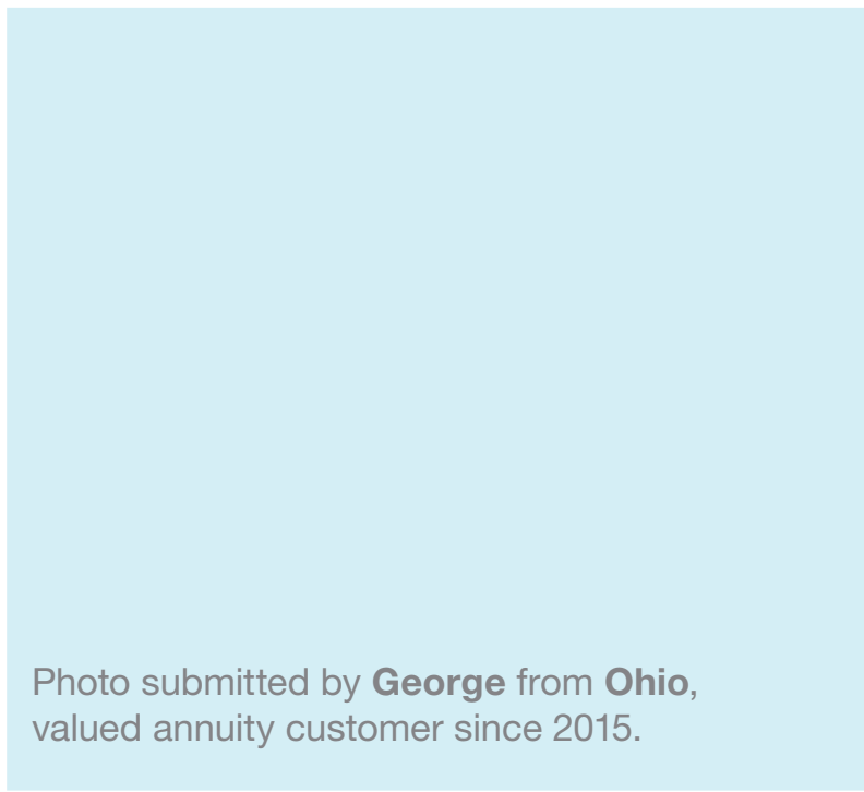
Photo submitted by George from Ohio , valued annuity customer since 2015.