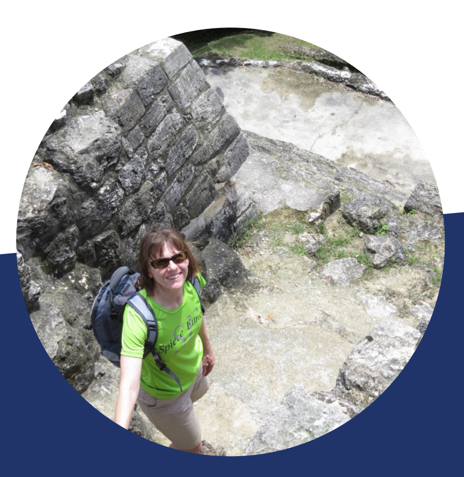
Photo submitted by Cheryl from Indiana , valued annuity customer since 2018.