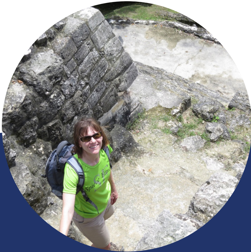
Photo submitted by Cheryl from Indiana , valued annuity customer since 2018.