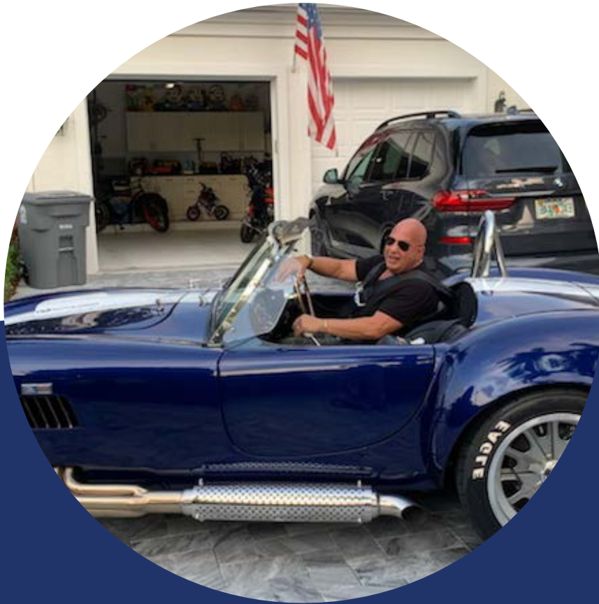
Photo submitted by Greg from Florida , valued annuity customer since 2018 .