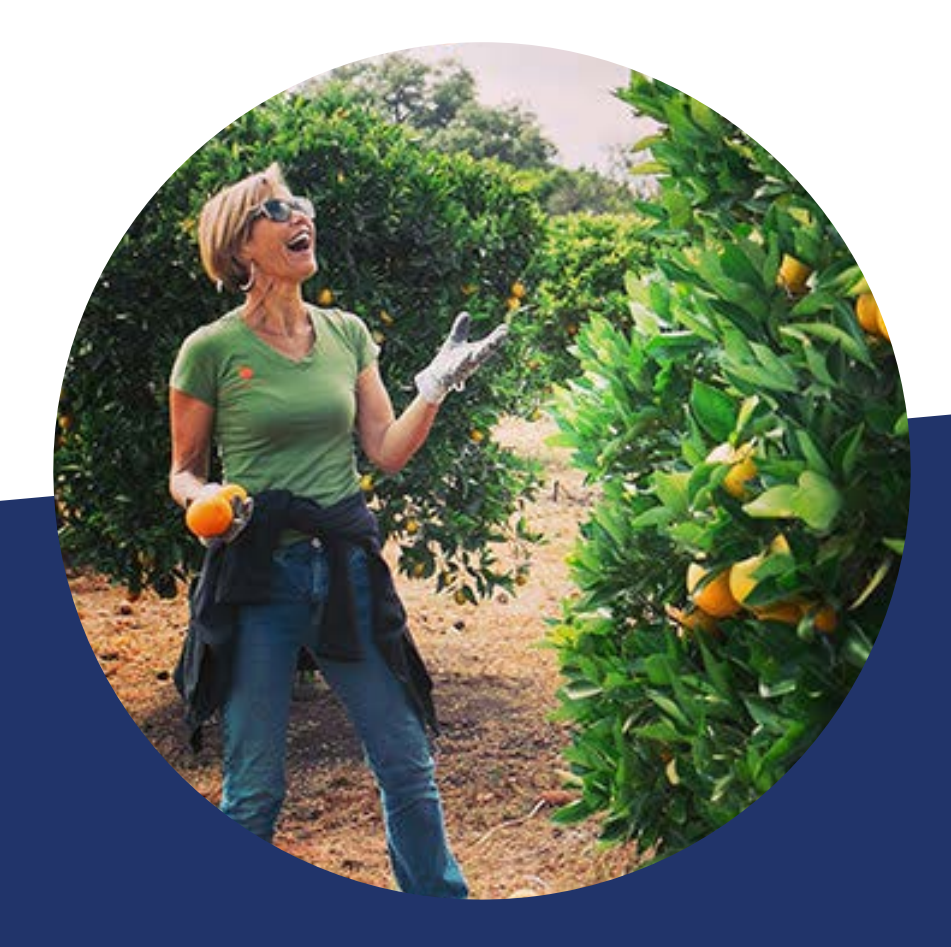
Photo submitted by Nita from California , valued annuity customer since 2019 .