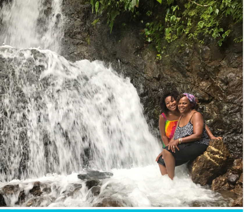
Photo submitted by Adrienne from Pennsylvania , valued annuity customer since 2002.