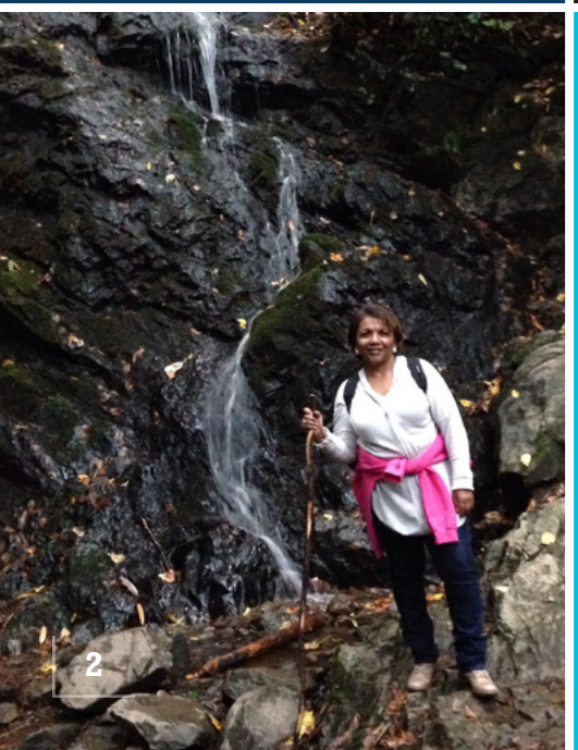
Photo submitted by Karon from North Carolina , valued annuity customer since 2007.