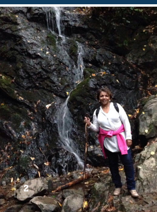
Photo submitted by Karon from North Carolina , valued annuity customer since 2007.