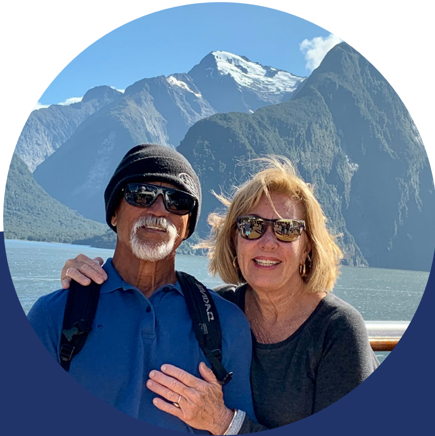
Photo submitted by Leroy from Hawaii , valued annuity customer since 2017 .