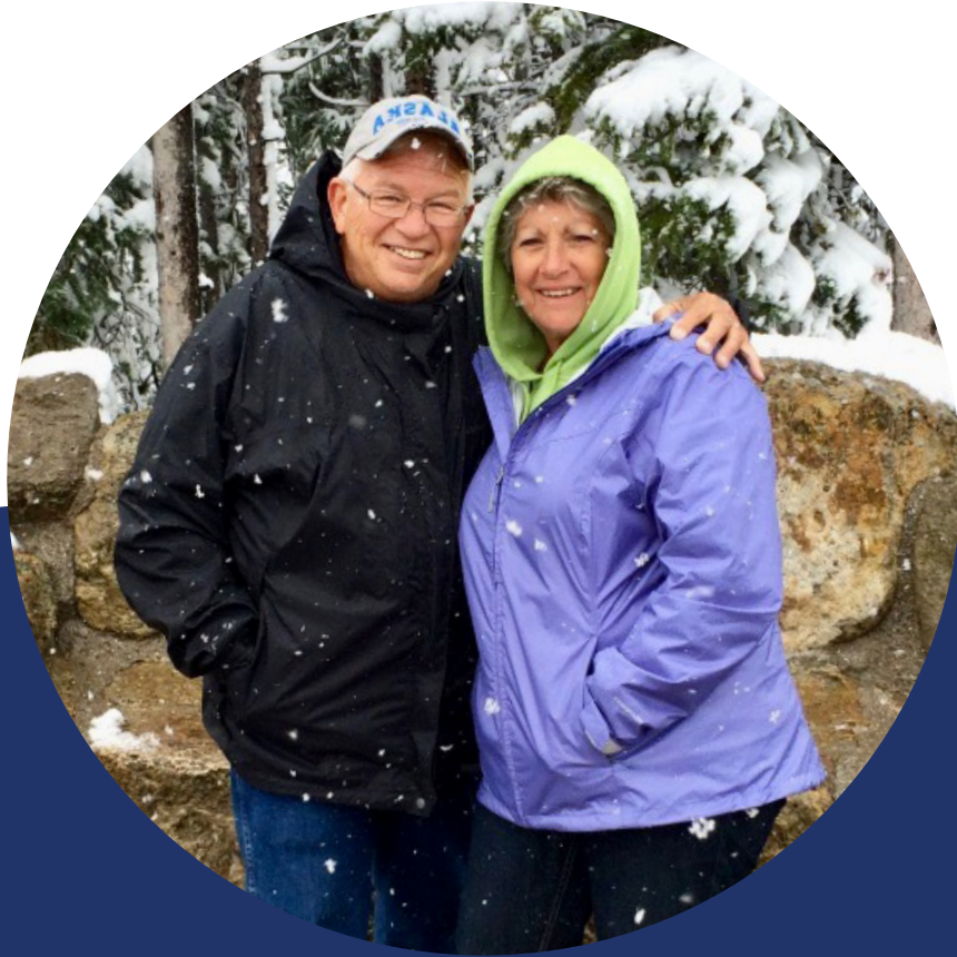
Photo submitted by Ed from Ohio , valued annuity customer since 2018 .