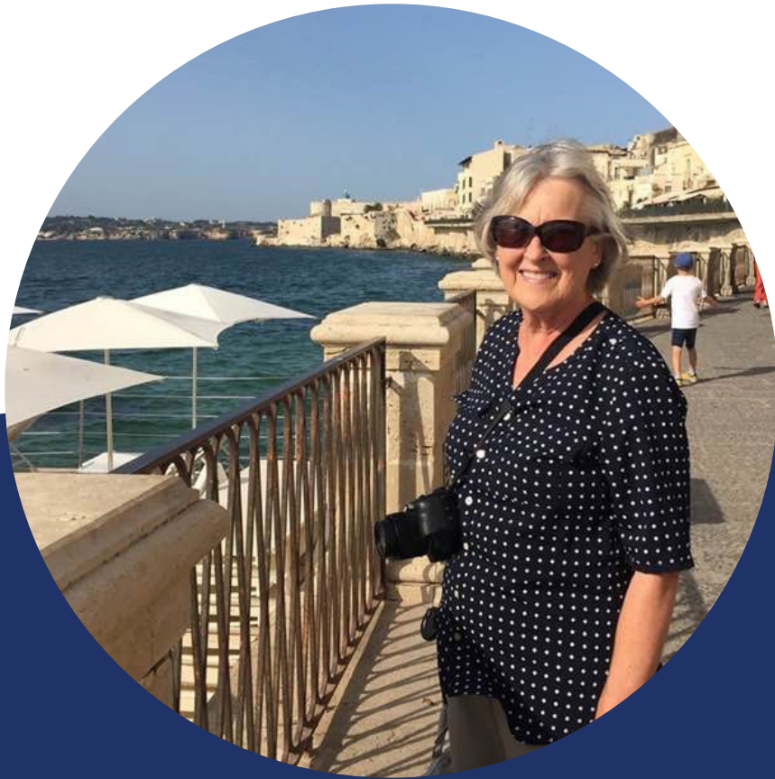
Photo submitted by Cheryl from Connecticut , valued annuity customer since 2016 .