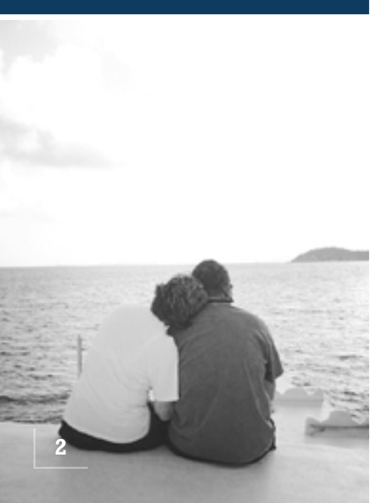
Photo submitted by Pam from Texas Great American customer since 2003