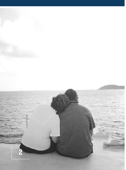
Photo submitted by Pam from Texas Great American customer since 2003