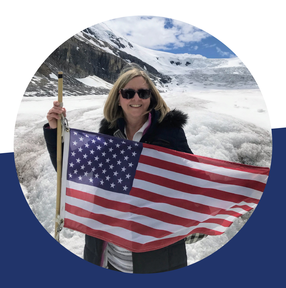
Photo submitted by Debbie from Tennessee , valued annuity customer since 2016 .