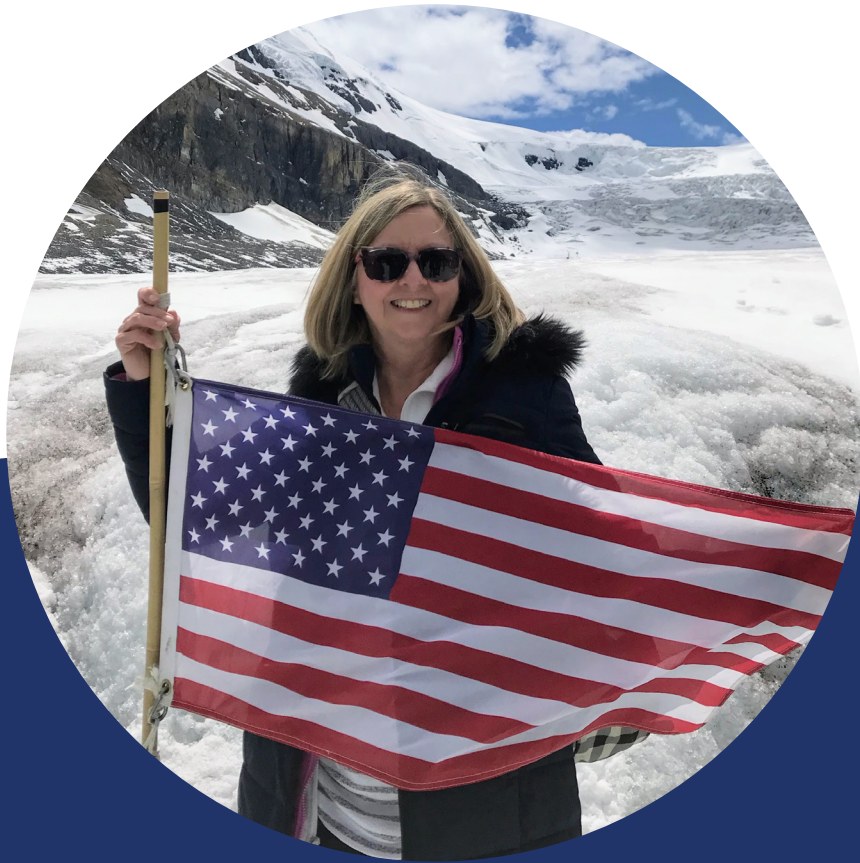
Photo submitted by Debbie from Tennessee , valued annuity customer since 2016 .