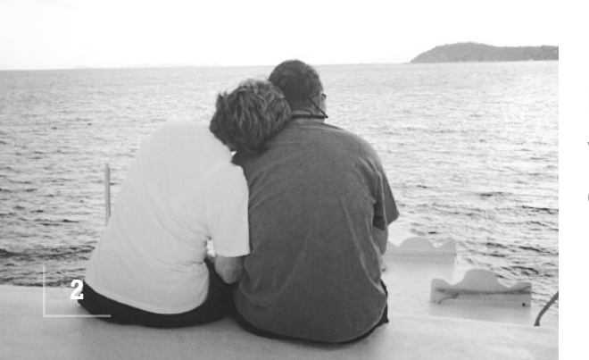
Photo submitted by Pam from Texas , valued annuity customer since 2003.

Uncomplicate Retirement<sup>®</sup> Great American Life. It pays to keep things simple.<sup>®</sup>