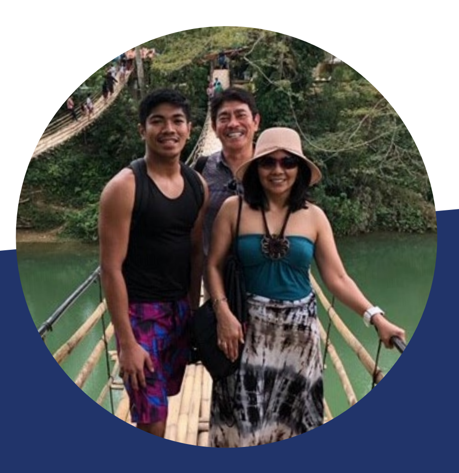
Photo submitted by Imelda from New Jersey , valued annuity customer since 2020 .