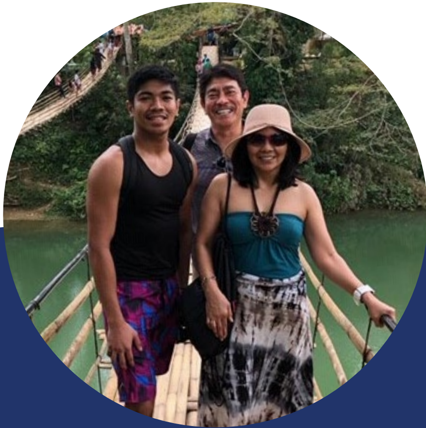
Photo submitted by Imelda from New Jersey , valued annuity customer since 2020 .