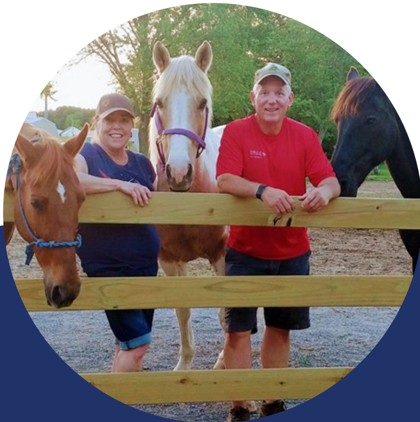
Photo submitted by Harriet from Missouri , valued annuity customer since 2016 .