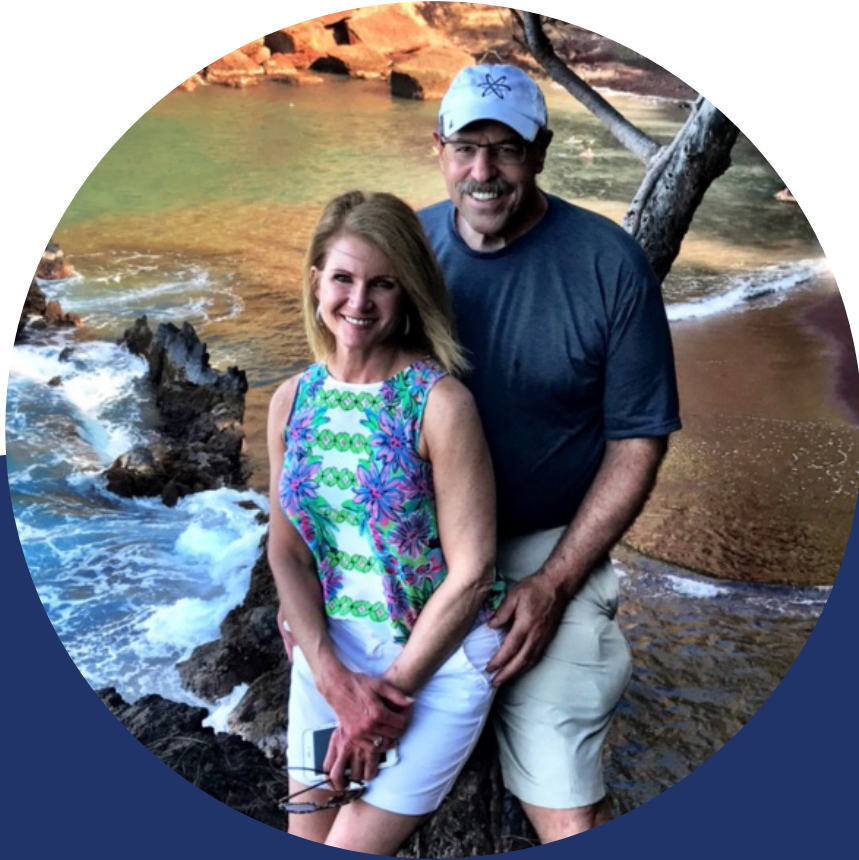
Photo submitted by Gregg from Connecticut , valued annuity customer since 2015 .